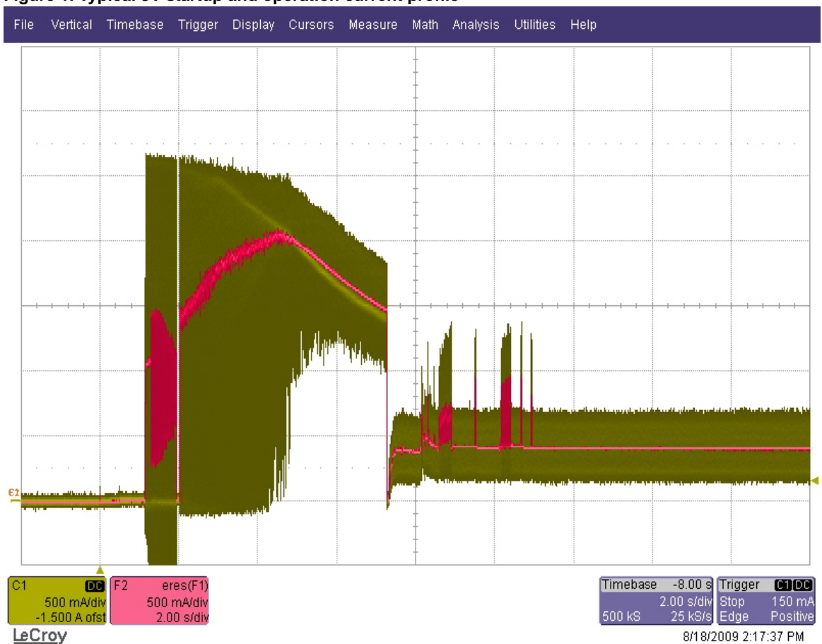
Figure 1. Typical 5V startup and operation current profile